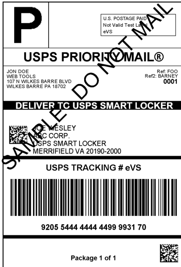
Figure 1: eVS Priority Mail Smart Locker Label