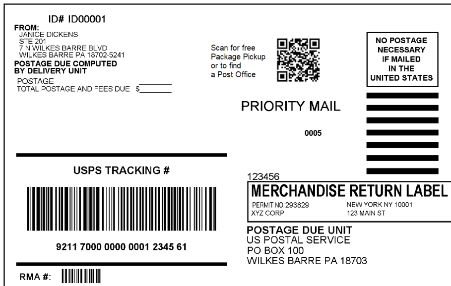
Figure 1: Sample MRS Label with QR Code

Merchandise Return Service (API=MerchandiseReturnV4) – Reference section 2.4.2.1